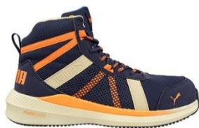
RIVAL BLUE/ORANGE MID