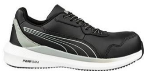
ZOOM BLACK LOW