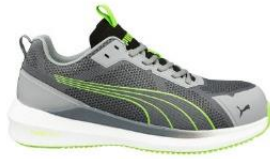
SLIDE GREY/GREEN LOW 654010