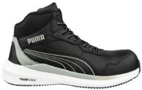
ZOOM BLACK MID 635030