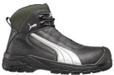
CASCADES MID 630210